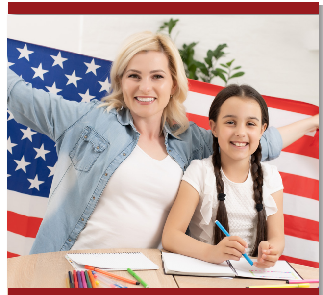
Recognize teachers who care about America!

Based on the nominees submitted, VFW chapters, called Posts, will recognize teachers in the following categories, K-5, 6-8 and 9-12. Posts then submit these winners' names and required documents to their District-level judging, who will forward their winners to the Department (or state) level. If your Department does not have a District judging, then submit to your Department Headquarters by Jan. 1. After judging, each Department then forwards their winners to VFW National Headquarters for consideration in the national awards contest.